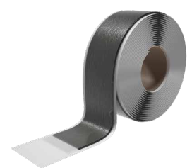
BLACK BAND page 144