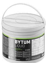
BYTUM LIQUID page 50