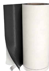
GROUND BAND page 32