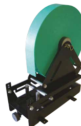
LIZARD page 388