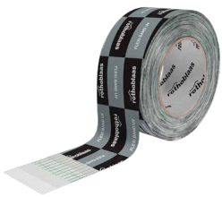
FLEXI BAND UV page 80