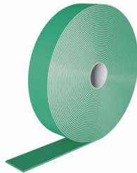
NAIL PLASTER page 134