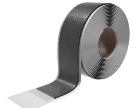
BLACK BAND page 144