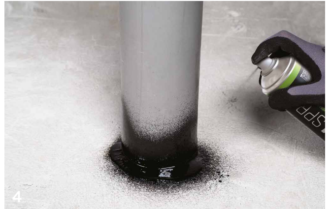
1 BYTUM REINFORCEMENT